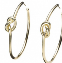
Love Knot hoops, $1,500; Finn