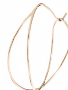
Double hoop earring, price upon request; Hirotaka