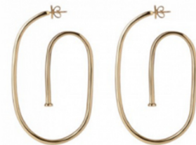
Large Pipe hoop earrings, $445; Jennifer Fisher