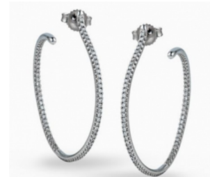
Twisted hoops in white gold with diamonds, $3,300; Simon G.