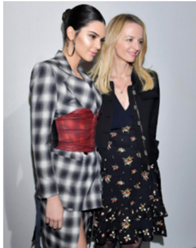
Kendall Jenner in hoops this month

So now's the time to take stock (literally) of the hoops you have in-store and augment your basic selection with a few of the many creative takes on the classic hoop style.