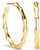
Signature hoop earrings, $450; Ritani

Fortunately, there are a plethora of options to be had—at every price point. Here are a handful of styles we've been doing flips over: