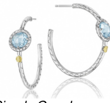
Simply Gem hoop earrings with blue topaz, $310; Tacori