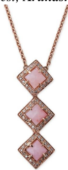
Vertical Kite necklace in 14k rose gold with guava quartz and pavé diamonds, $4,500; Jacquie Aiche