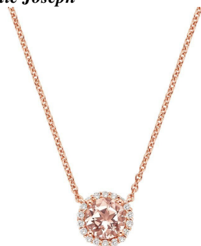
Halo Diamond Pendant in 14k rose gold with morganite, $925; Brilliant Earth