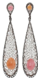
Earrings in 18k oxidized black gold with 13.36 cts. t.w. conch pearls, 9.02 cts. t.w. rose-cut diamonds, and 2.90 cts. t.w. full-cut diamonds, price upon request; Arunashi