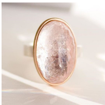
Ring in silver and 14k yellow gold with morganite, price on request; Jamie Joseph