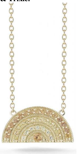
Small Rainbow necklace in 18k gold with 0.1897 yellow sapphires, $1,760; Andrea Fohrman

2. Dress Tangerine-colored clothes with a yellow jewel for a vintage effect, like design house Alice & Trixie.