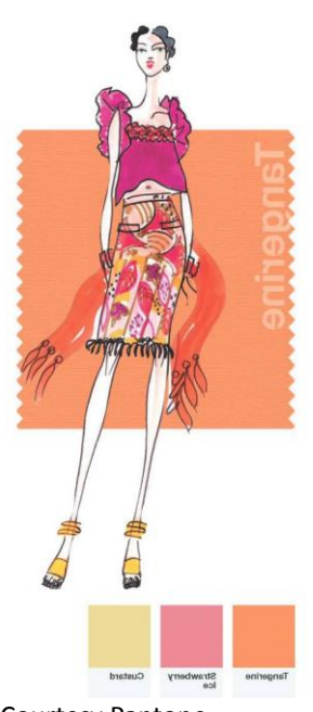
Courtesy Pantone Outfit by Yoana Baraschi 4. Play up a print featuring Tangerine by wearing a

Tangerine by wearing Tangerine-colored jewel.