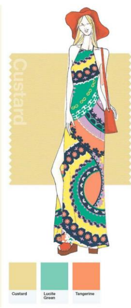
& Trixie" width="457" height="1024" /> Courtesy Pantone Dress by Alice & Trixie 3. Adorn Tangerine outfits with a bright pink jewel to mimic the