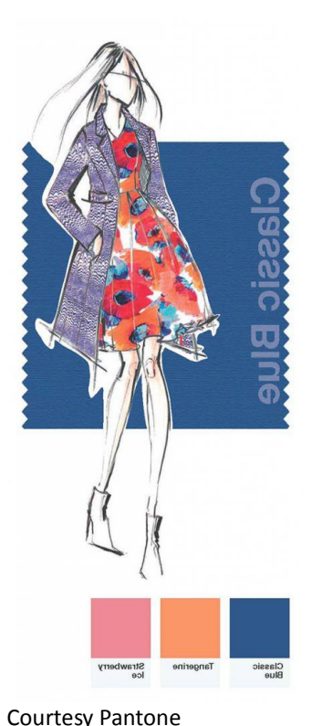
Dress by Trina Turk 2. Dress Tangerine-color

Florere earnings in 18k gold with 50.66 cts. t.w. London blue topaz and 1.968 cts. t.w. diamonds, $11,110; Vianna