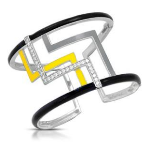
Convergence bangle in hand-painted multicolor Italian enamel with CZ and rhodium plating, $495; Belle Étoile