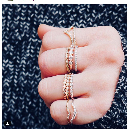
◆ 232 個讚好 ● 4 則回應 Strength in numbers ④ #stacks 1月20日週前