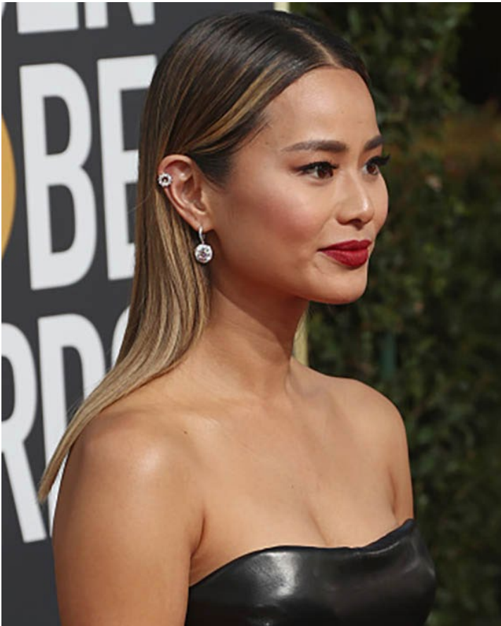
“Jamie Chung in Chopard diamond pendant earrings and a Floating Diamond stud.”