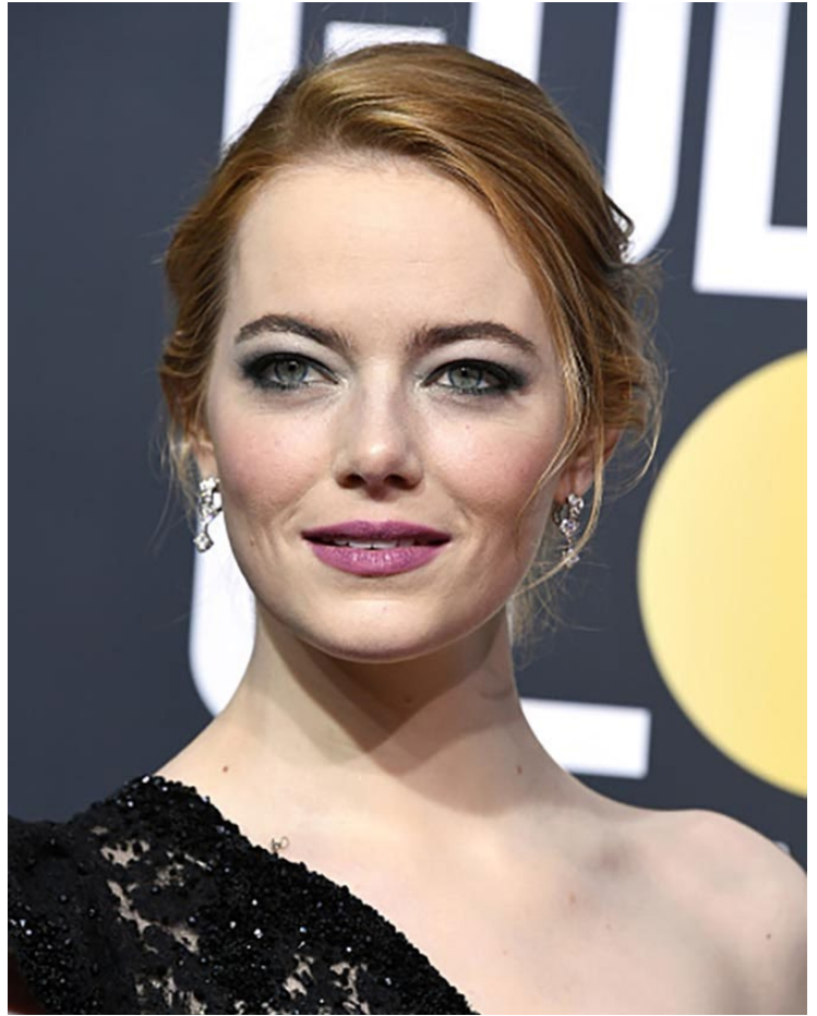
“Emma Stone in Louis Vuitton signature diamond earrings.”