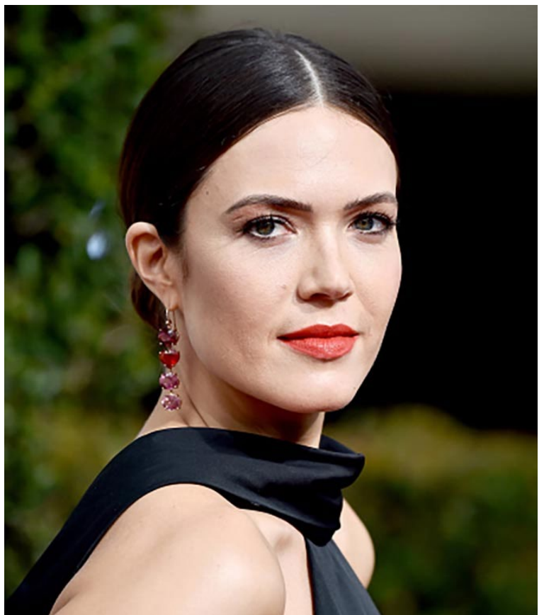
“Mandy Moore in multi-gem earrings by Irene Neuwirth.”