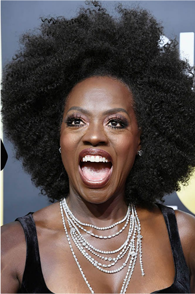
“Viola Davis in a Harry Winston 111.48-carat diamond and platinum Secret Combination Diamond Necklace and 8-carat round brilliant cut diamond and platinum earrings.”