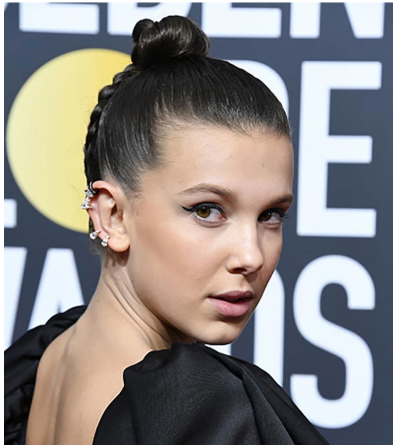
“Millie Bobby Brown in a diamond ear cuff by Repossi.”