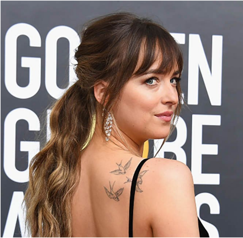
“Dakota Johnson in Nirav Modi earrings featuring a cascade of diamonds in various shapes.”