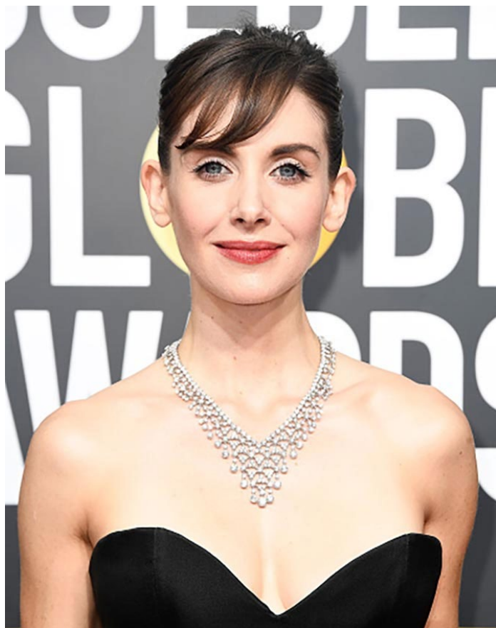
“Alison Brie in a Bulgari diamond necklace.”