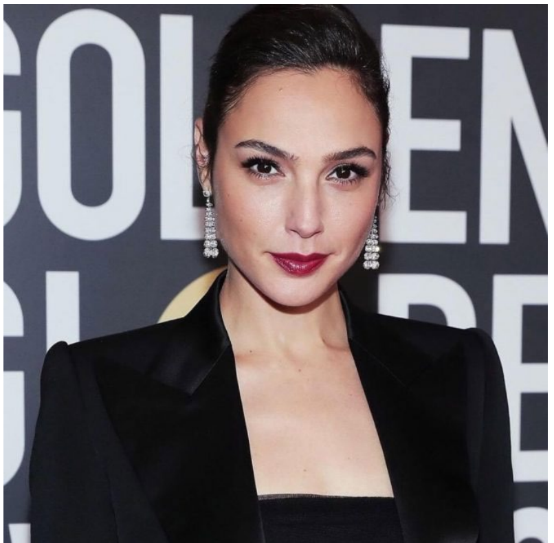
“Gal Gadot in Tiffany diamond and platinum chandelier earrings.”