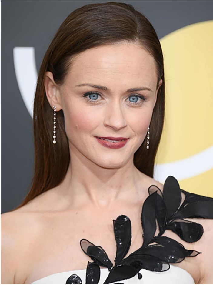
“Alexis Bledel in Forevermark x Jade Trau Alchemy diamond earrings.”