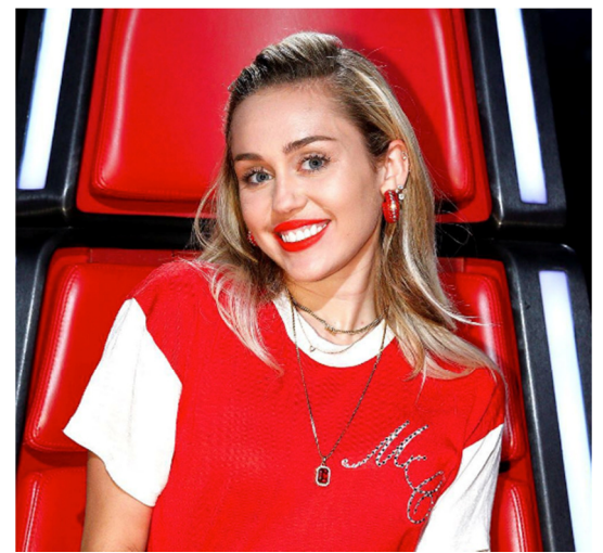
Ruby pendant necklace, red plastic/acrylic earrings, and fire-engine-red lipstick—only Cyrus could pull it off (Image: @nbcthevoice)