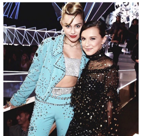
Going full Elvis in diamond hoops and bedazzled belts with Stranger Things star Milly Bobby Brown