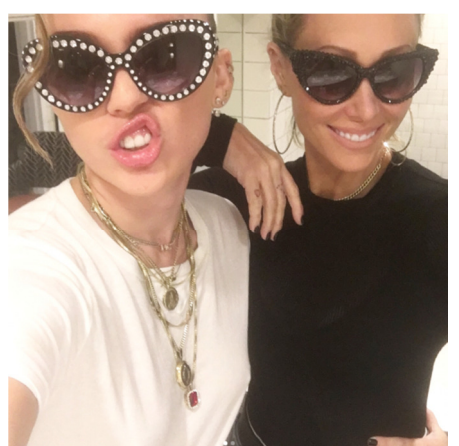
Necklace layering 2.0, with a side of rock 'n' roll sneer