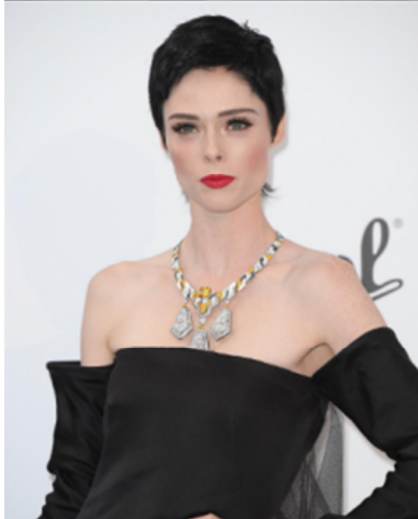
Coco Rocha in a Boucheron necklace