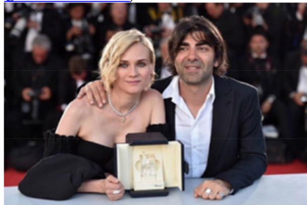
Diane Kruger in a Chopard diamond necklace and ring