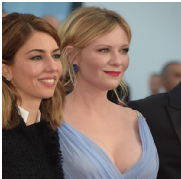
Kirsten Dunst in Chopard sapphire earrings