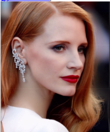
Jessica Chastain in Piaget earrings/ear climbers