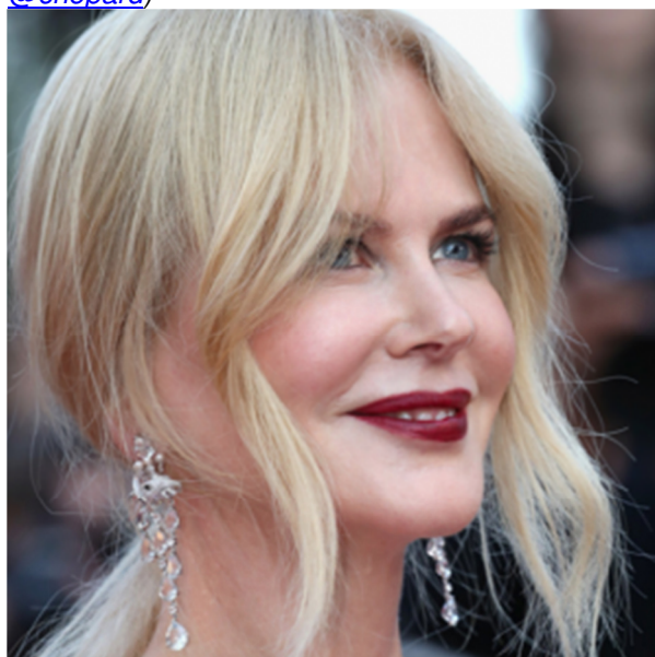
(Top and above) Nicole Kidman in Lydia Courteille earrings