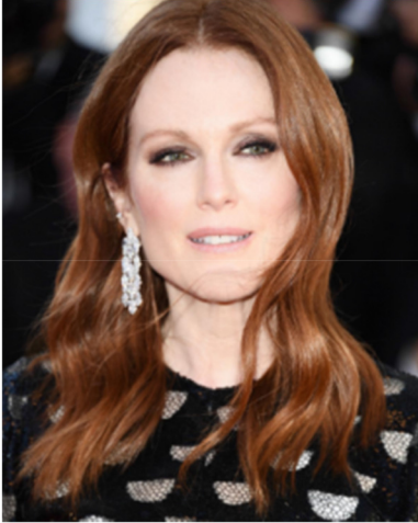
Julianne Moore in Chopard earrings

Here are some of my favorite jewelry looks from the event, which wrapped up this past weekend: